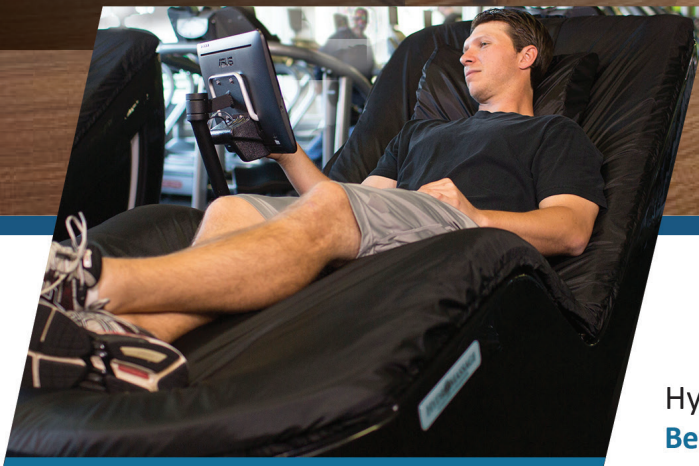
HydroMassage Bed & Lounge Models