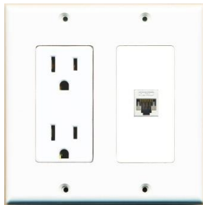
Standard, 110V Wall Outlet with CAT-5 or CAT-6 Jack